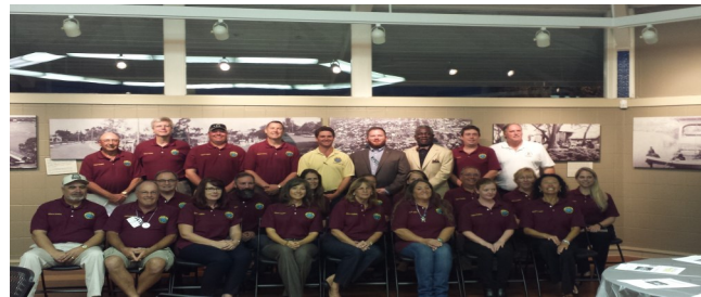
1st graduating class from Citizens Academy

department. Each week, Citizen's Academy students explored a different department within the city, from Fire and Police to Public Works and Cultural Services. Participants learned about the issues the city faces and had the opportunity to talk with city leaders and key staff members.